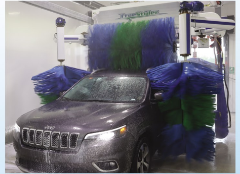
Powerful five-brush system cleans everything it touches, delivering up to 20 clean cars every hour

In the event of a system fault, operators can choose to receive instant notification via numeric pages or more detailed e-mail alerts. The Web-enabled touch screen controller offers powerful remote access, plus unparalleled programming flexibility.