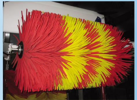
Available Whisper Wheel® top wheel fill runs quietly, increasing customer perception of a gentle wash process