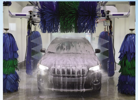
Available HydroBlade® with Wheel Stinger® adds high pressure and wheel cleaning upsell opportunities